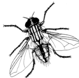
Figure 3. House Fly