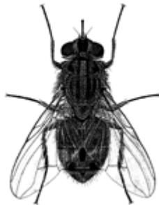
Figure 2. Stable Fly